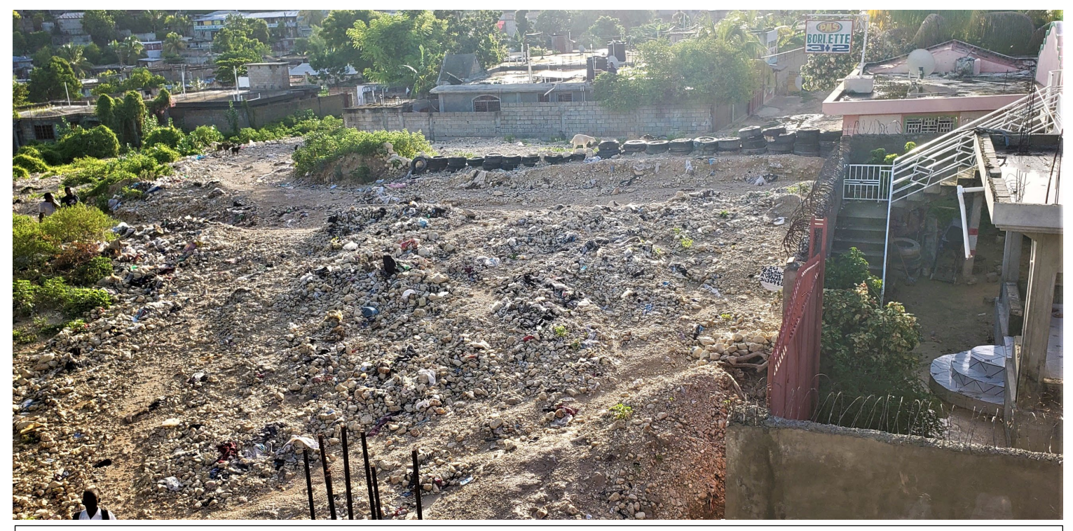
Rocks and rubble fill the streets around the mission and pile up against the walls of buildings and homes. No one comes to take them away, so it just gets worse.