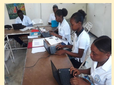
Computer & Business Class