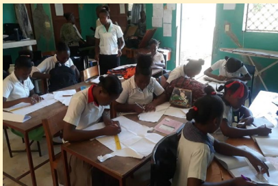
Busy making sewing patterns