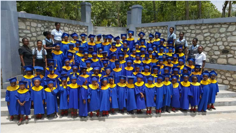
Above: The Kindergarten Graduates! What beautiful children! Right: Students display their decorated ponies!