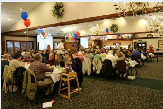
Fall Benefit 2015