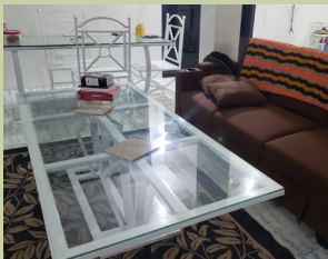
These tables and chairs were made by welding students.

This link will take you straight to the Benefit page: https://www.livinghopehaiti.org/fall-benefit-info