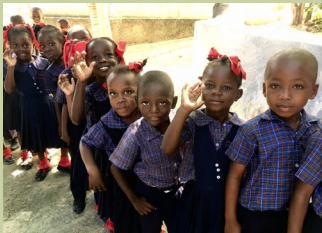
Precious preschoolers line up to start the school day.