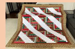
Country Christmas, 95x84 , a magnificent Christmas quilt, would be at home on a large bed or in a cozy room with a Christmas tree. Hand quilted with matching thread colors, this masterpiece is destined to become a family heirloom.