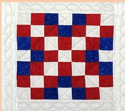
America, 78x72 , is a nearly square quilt that is reminiscent of the 4 th of July. Machine pieced and hand quilted with threads of the same bright reds and blues of the quilt pieces, this is a patriotic work of art.